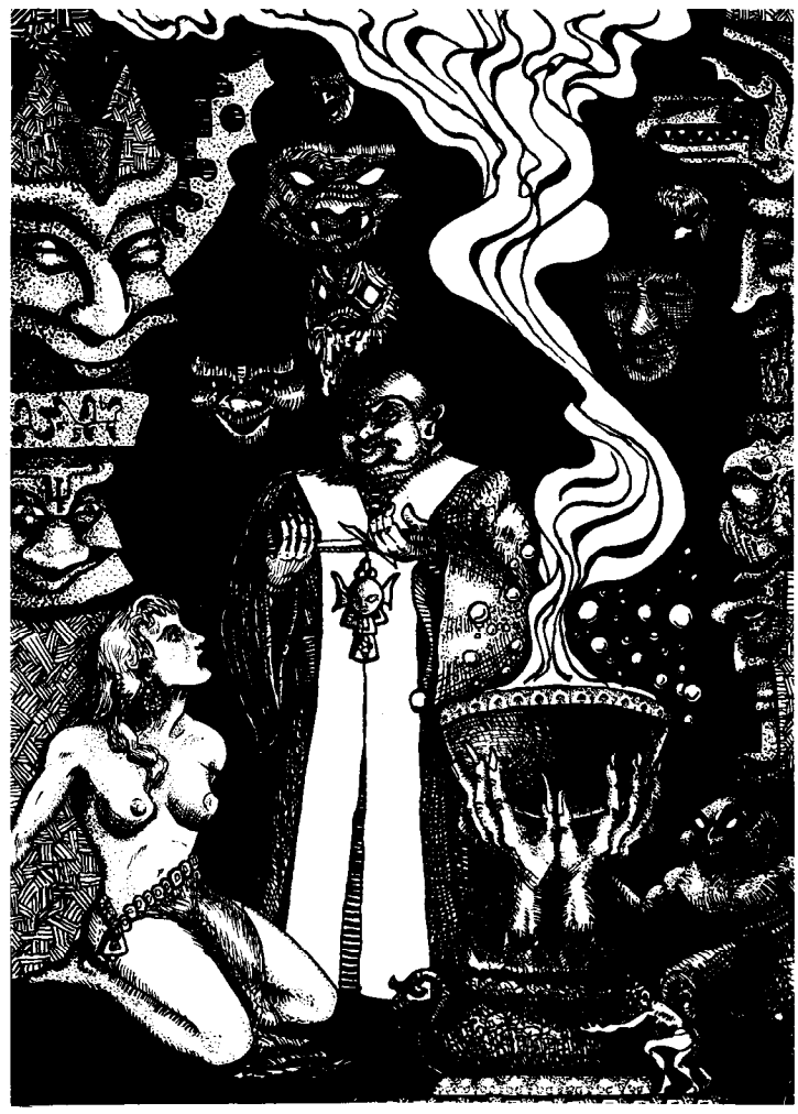
"A High Priest of Duritlamish preparing to offer up sacrifice." He has removed his grey corpse-like face paint as a sign that he now stands before the Reality of Evil, and he has put on the "Drymial." the surcoat of special devotion and specifica."

Illustration by the author from Empire of the Petal Throne